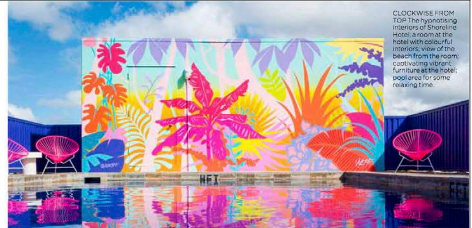
CLOCKWISE FROM TOP The hypnotising interiors of Shoreline Hotel; a room at the hotel with colourful interiors; view of the beach from the room; captivating vibrant furniture at the hotel; pool area for some relaxing time.